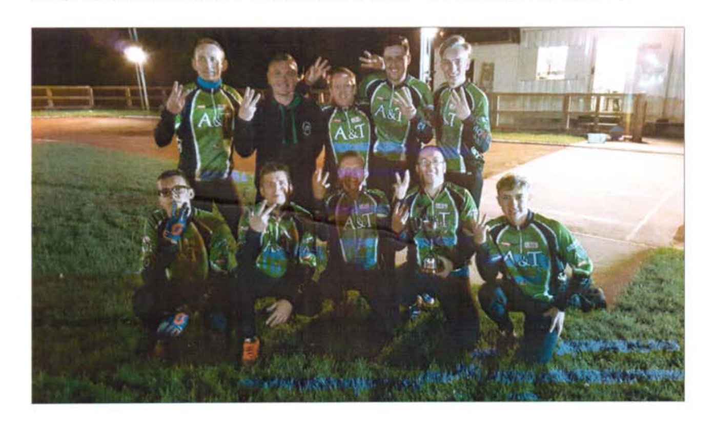
Astley & Tyldesley beat Stockport 95-83 in Play Off match at Bury, to win the Northern League Division 1.